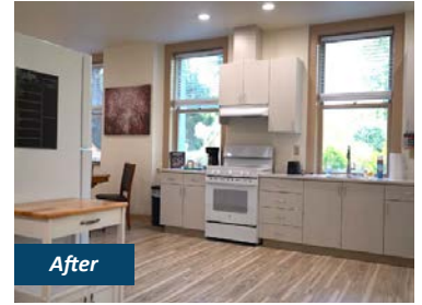
St. Joseph Family Shelter Kitchen