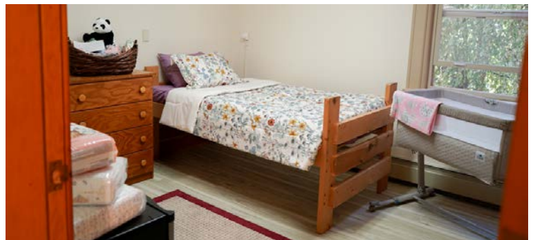
Father Taaffe Homes St. Gertrude Suite Room