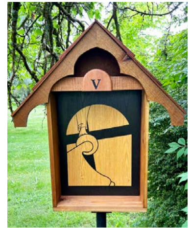
Before and after: Renewed in beauty and detail.